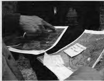
Forest management plan

Woodland owners with an approved forest management plan that addresses emerald ash borer can salvage and restore ash in riparian areas when they follow the prescribed Best Management Practices.