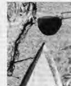
D-shaped exit hole