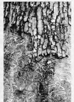
Galleries under bark